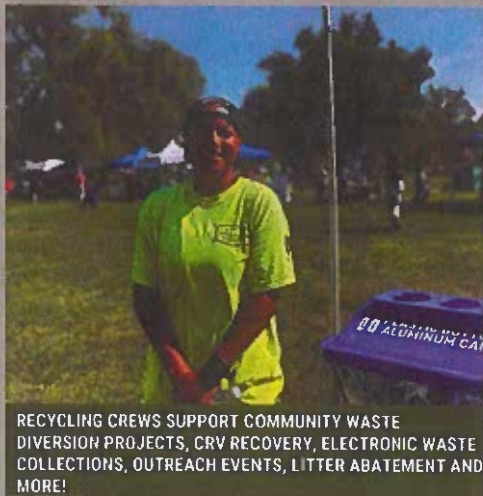
RECYCLING CREWS SUPPORT COMMUNITY WASTE DIVERSION PROJECTS, CRV RECOVERY, ELECTRONIC WASTE COLLECTIONS, OUTREACH EVENTS, LITTER ABATEMENT AND MORE!