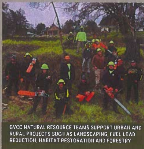
GVCC NATURAL RESOURCE TEAMS SUPPORT URBAN AND RURAL PROJECTS SUCH AS LANDSCAPING, FUEL LOAD REDUCTION, HABITAT RESTORATION AND FORESTRY